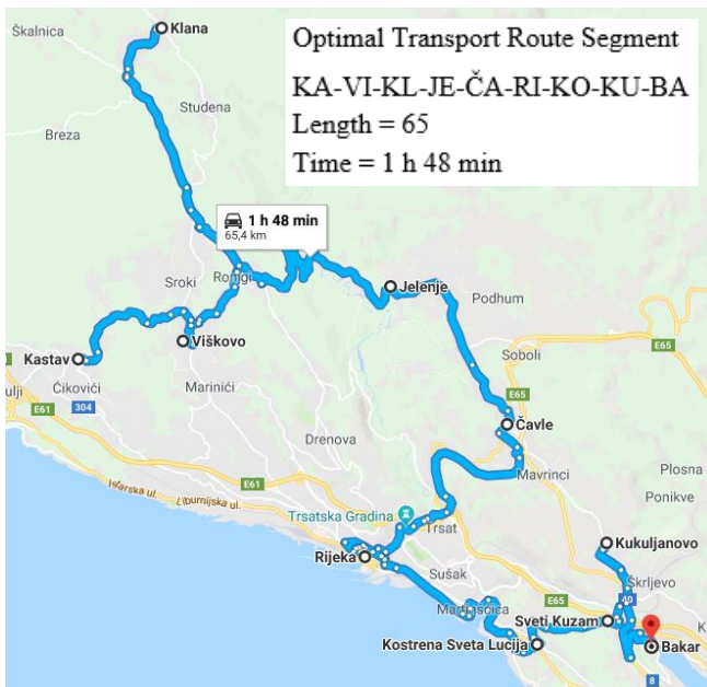
Map 2. Optimal transport route