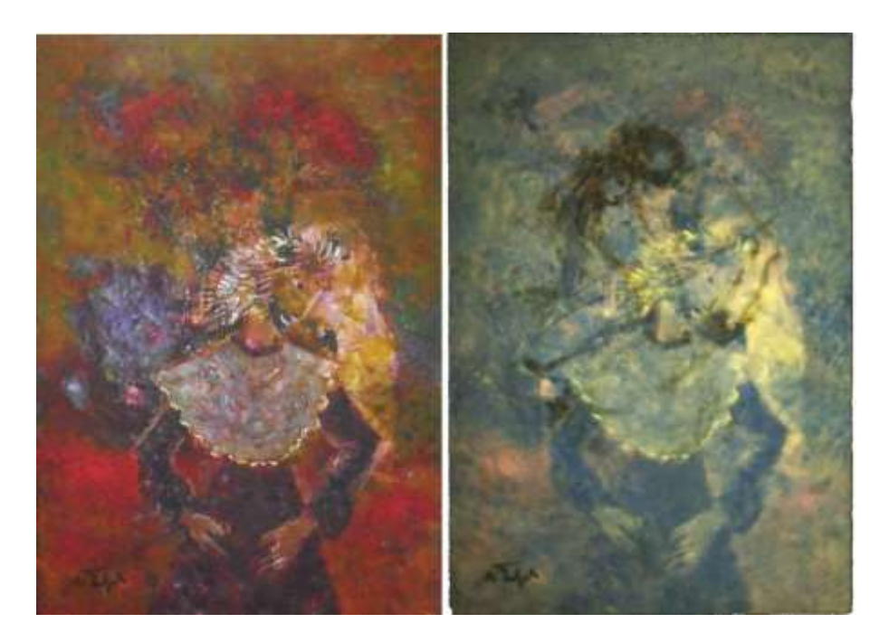
Image 4.1. 4.2: Nada Žiljak, "Zagrljaj", infrared fine art, visual and blockage red Animation at: <u>www.nada.ziljak.hr/n134.mp4</u>

4.2) and a blockage at 665 nm where the blue component remained (Image 4.3). At 850 nm, only those colorants that absorb NIR radiation well remained recognizable. In the painting with a blockage at 590 nm, drawing Z is noticeable since the yellow and part of the red component are "missing". This occurrence of the Z image visibility is enhanced with higher blockages after 600 nm.