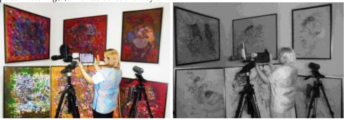
Image 1: Dual information of paintings; visual and near infrared reflectography

using this innovative method of making artwork is new paintings that have found their place in contemporary art galleries /2/. It is suggested to extend the measurement of parameters that describe colors and colorants both in the VIS and NIR spectrum. It is a new tool for studying images of old as well as modern masters. Painting is also improved in the areas of individualization, authorship attribution and the safety of the work of art.