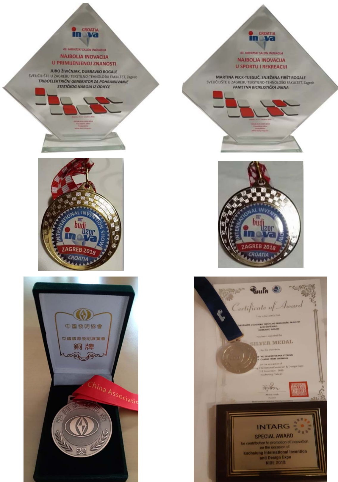
Figure 2. The awards for student innovative projects