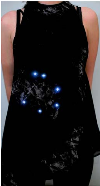
Figure 3. e-shirt

Should an injury occur, the labourer will change the way he moves and stands and the microcomputer will, based on this data, conclude that an injury has occurred and then activate the executive device (a cell phone or radio transmitter) which will then forward a request for help to rescuers, along with GPS data regarding the position of the worker. The microphone and miniature sound device can then further facilitate communication if needed.