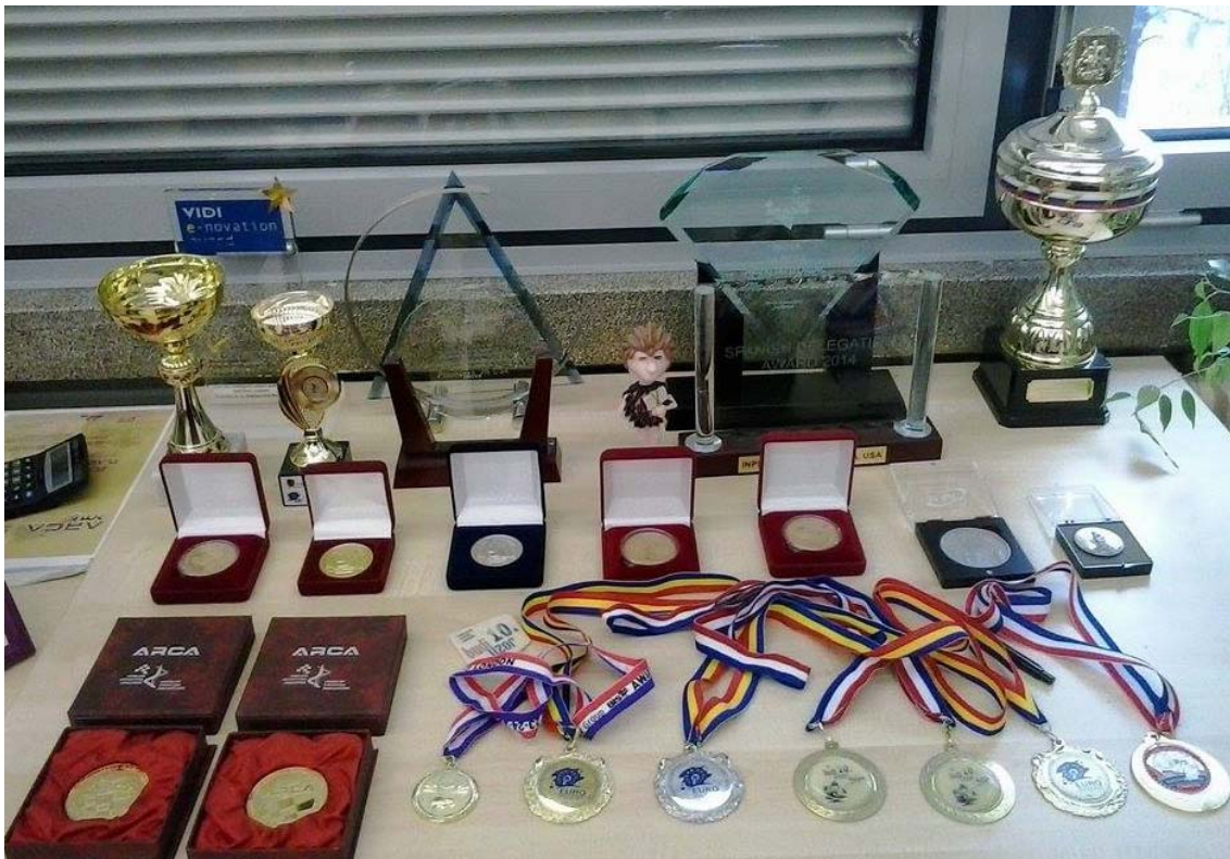
Figure 1. Several awards for intelligent clothing and thermal manikin

As part of the bilateral project Development of smart clothing for people with dementia (funded by the Ministry of Science and Education) of the aforementioned scientific team and team at the Faculty of Mechanical Engineering of University in Maribor, smart clothes for demented persons has been developed. The goal of developing smart clothing for people with dementia is to provide comfortable clothing with active character, that is, smart clothing that will be equipped with modern sensors for the installation of clothing and the benefits of information technology. Such a clothes could help and guide the user in everyday activities, therapies, maintenance of everyday personal hygiene, appearance editing, and / or automatic tracking of body functions, as well as user location information to the dental care caregiver.