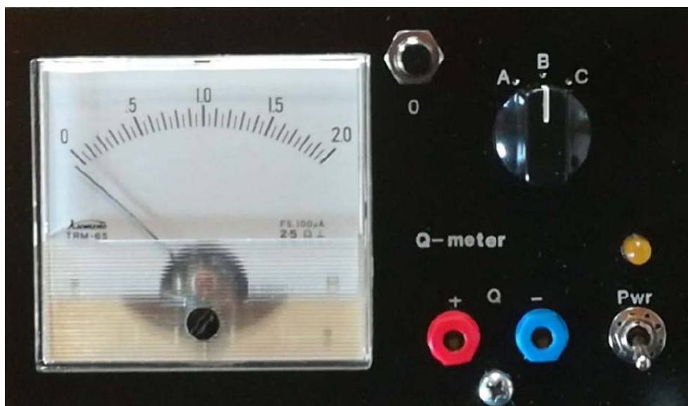
Figure 5. The triboelectric generator

The triboelectric generator is a device that has the ability to store a static charge that can occur in many different ways, and one of them is by rubbing two materials, figure 5 [7].