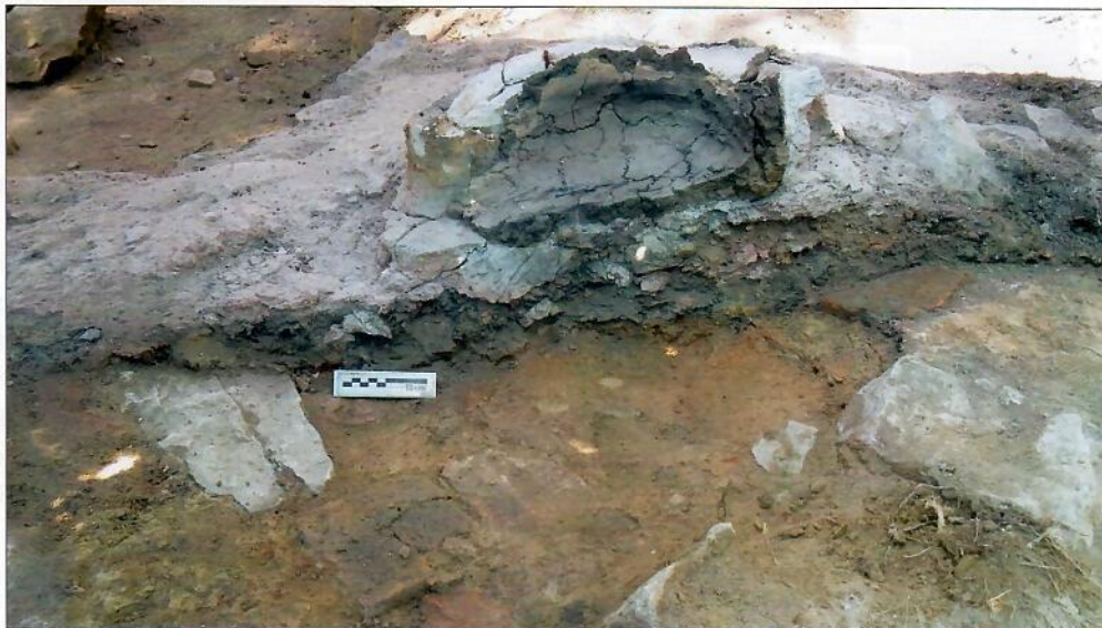
Fig. 5: Strata observed during dismantling of the stand-alone smelting furnace