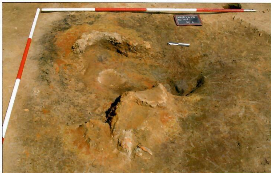
Fig. 7: The site of Virje-Volarski breg: hearth of smelting furnace SJ 008, with a highly fired base in the center at the bottom, the so-called "bowl", with a semicircular black layer beyond the exterior surface of the furnace