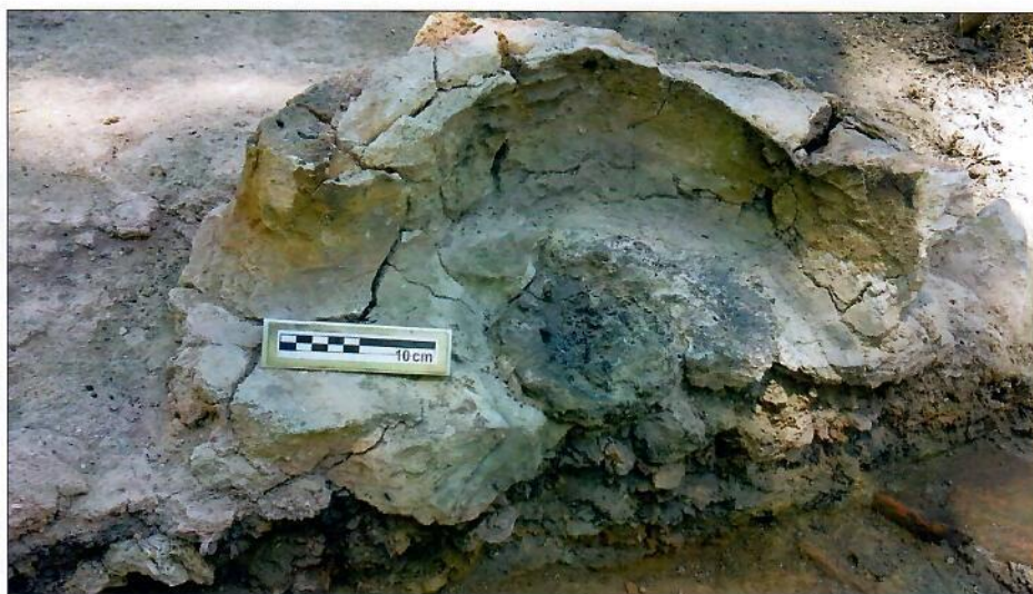
Fig. 6: Highly fired bowl-shaped base of the furnace hearth, the so-called "bowl"