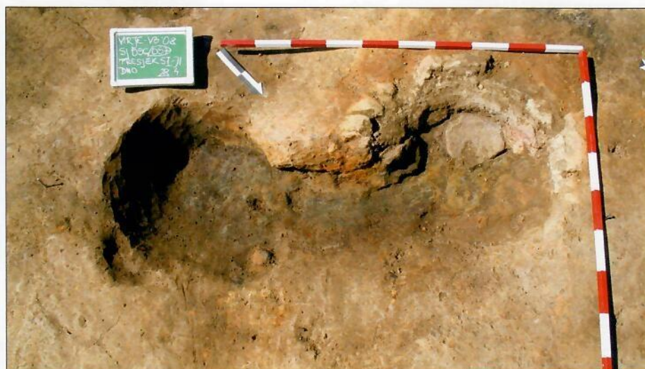
Fig. 8: The site of Virje-Volarski breg: remains of smelting furnace SJ 056 with a visible highly fired bowl-shaped base, the so-called "bowl" in the center of the hearth