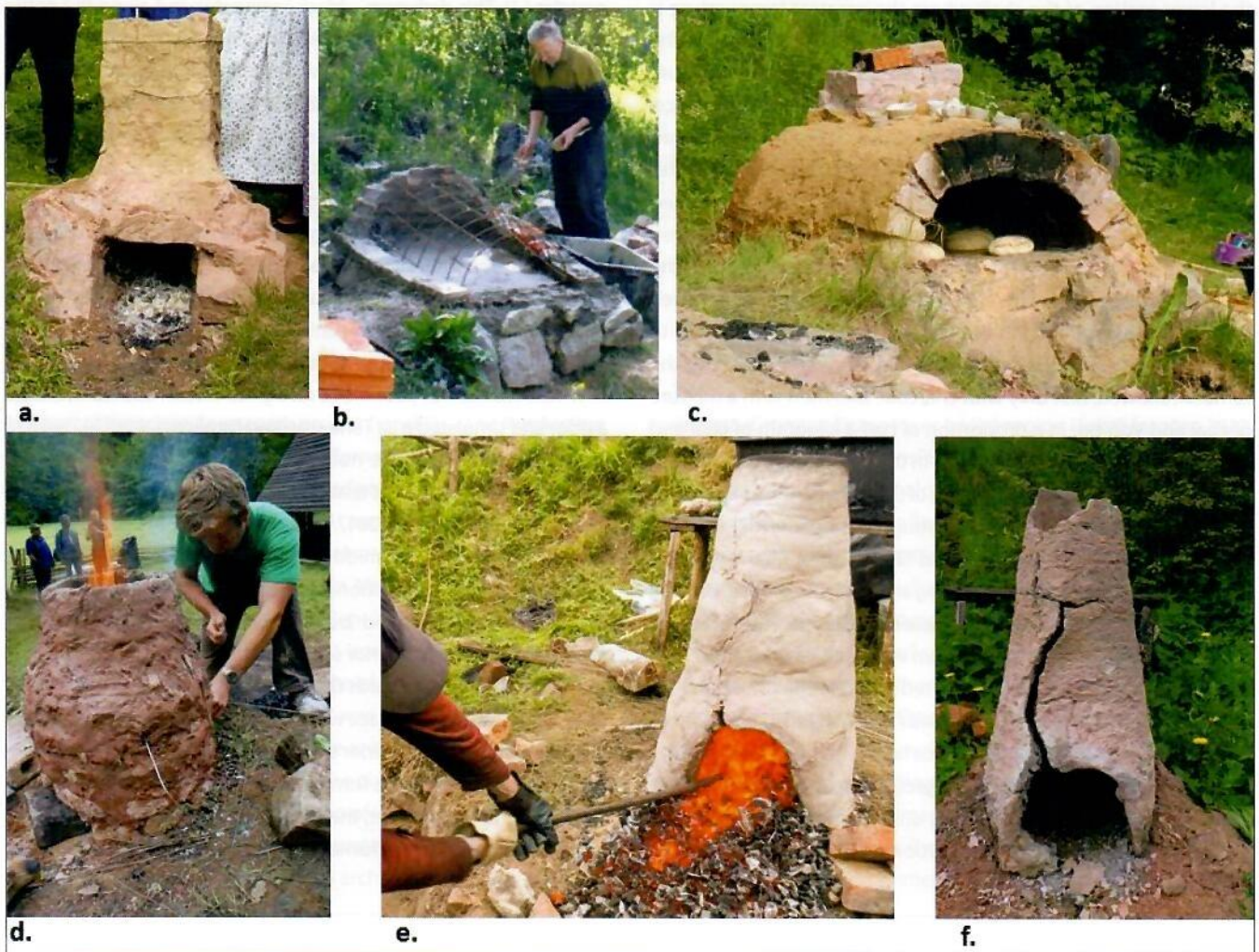
Fig. 1: Earlier built elements at the site of the free standing bloomery furnace: a) furnaces with a rectangular hearth from 2006; b) construction of the baking oven; c) baking oven (-2); d) construction of the so-called La Tène furnace in 2011(0); e) smelting in the furnace built in 2015 and the latter's appearance after several months (f)

The objective of participation of members of the TransFER project team in the workshop for smelting iron ore in the Czech Republic, in addition to education and active experience of smelting iron ore in furnaces, was also the comparison of the varied results acquired. This included the measurement of temperatures in the interior of the smelting furnaces during two different smelting processes. While opening the "door" immediately prior to removal of the sponge-like iron ( bloom ), the temperature of the second smelting in two measurements was around 1100°C (first measurement: 1100°C; second measurement: 1125°C), as at the same spot in the third smelting: 1100°C. The molten slag, that discharged from the hearth at the moment the furnace was opened, had a temperature of 926°C next to the opening, and 870°C somewhat further along the channel, while the temperature of the molten slag in the third smelting, further along the channel, was 800°C. The comparison of the temperatures indicates approximately similar values while in the third smelting, the temperature was measured through the nozzle/tuyere, where it was ca. 1300°C. Although measurements are lacking for the closed inner part of the hearth of the furnace