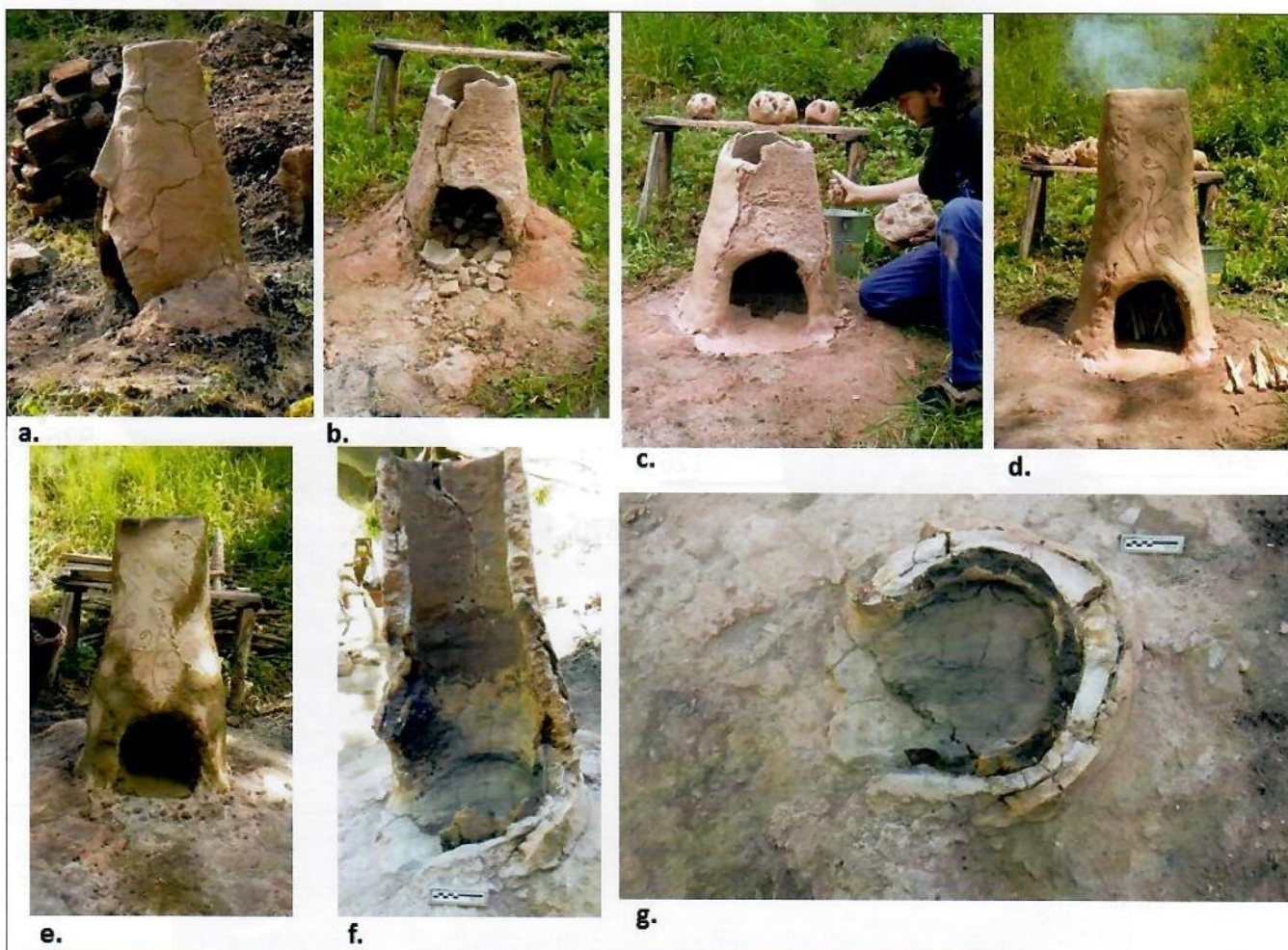
Fig. 2: Free-standing smelting furnaces: a) furnace with an anthropomorphic figure built in 2016 (Archives of the Technical Museum in Brno); b) the walls of the furnace as found in 2017 (1); c) repairs to the above furnace; d) renovated furnace (2); e) last repairs with a visible new layer of clay on the base of the hearth (3); f) cross-section of the dismantled smelting furnace with visible layers (1, 2, 3); g) plan of the base of the hearth with visible layers (1, 2, 3) (b-g: photo: T. Sekelj Ivančan)

temperature in the repaired furnace should be greater than the latter. If we choose the other hypothesis, it should be emphasized that the process itself in the last smelting was shortened, and as a result the product was a spongy iron still containing considerable slag, which could not be shaped subsequently. Although both possibilities remain open as to how the "bowl" could have been created, what further supplements our knowledge is that identical fired bowl-shaped bases, the so-called "bowls", were also found at archaeological sites in the Podravina region, at Volarski breg in Virje and Velike Hlebine in Hlebine (Sekelj Ivančan 2009: 66–67; Sekelj Ivančan, Valent 2017: 74–75). And even the layout discovered after the dismantling of the remains of the freestanding furnace and cleaning of the excavated surface displayed certain similarities to the furnaces in the Podravina region. The most noticeable was the fired earth in a width of ca. 20 to 25 cm that extended around the exterior surface of the furnace hearth. In addition, a surface with a distinctly black color was noted, which extended in a width of up to 40 cm around the fired earth on the rear side of the furnace, which would be related to the place from which charcoal was placed in the furnace. An almost identical situation was noted at the archaeologically excavated smelting furnaces at both sites in the Podravina district cited above.