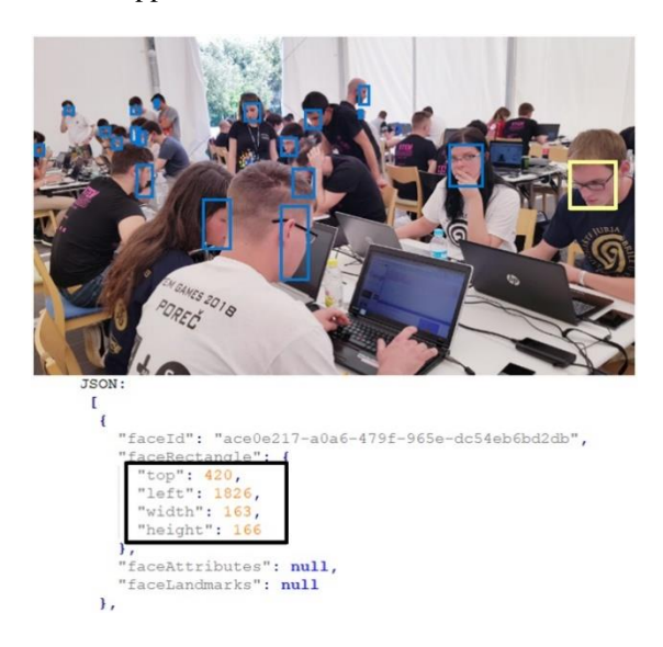
Figure 1. Face detection using Microsoft Cognitive Services API with the accompanying JSON code defining one of the face boxes in the picture.

The first step in the estimation of emotions from facial features using visual sensors is to detect a human face in a video. To do this, the incoming video stream is sampled into frames. Individual static pictures are then evaluated separately. The relation of two pictures in terms of detected objects or emotions is not necessary. The Viola-Jones method is efficiently used for face detection in the literature (Deshpande & Ravishankar, 2017). The result of Viola-Jones detector is a rectangle that envelopes the region of the sampled video frame, most probably, containing a human face. After faces in a scene have been identified, the system can proceed to recognize facial features and estimate emotions from each sampled frame. An example of facial detection is in Fig. 1. Microsoft Azure Cognitive Services (Microsoft Azure Services, 2020) offers computer software developers a convenient tool for facial detection that can be easily integrated with different application architectures.