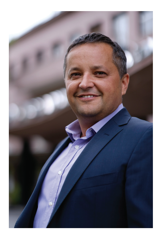
Dear colleagues, dear friends,

It is my great honour and pleasure to invite you on behalf of the Organising and Scientific Committee to participate in the 4<sup>th</sup> International Congress on Food Safety and Quality under the slogan "One Health", which will be held in Dubrovnik, from 9 to 12 November 2022.