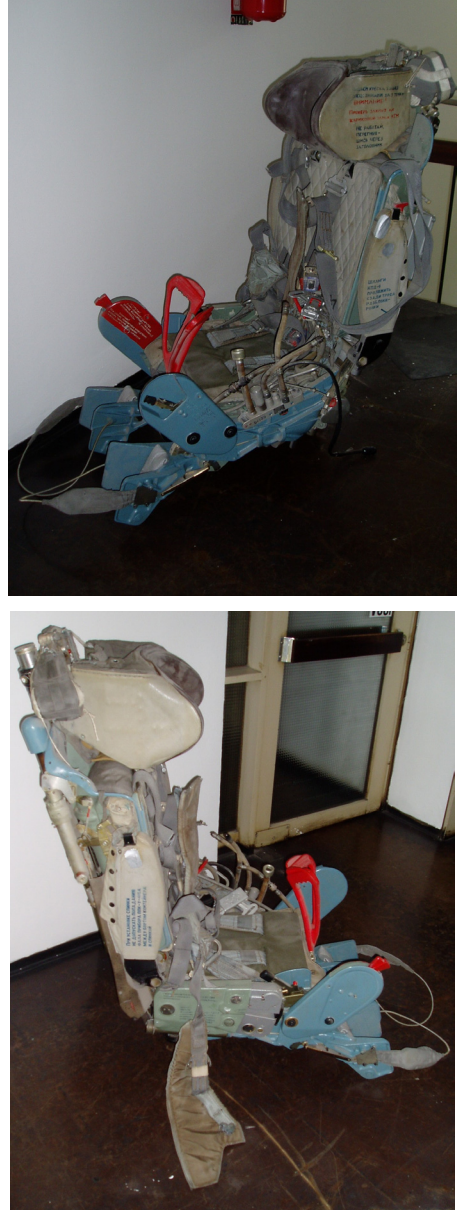
Figure 1: Ejection pilot seat KM-1

In Figure 2a), on Gaussian curve of hip width of male population is drawn the line x = 40 cm which represent width of sitting area of seat KM-1. Only pilots that have hip width smaller than width of sitting area of seat can comfortably sit. Calculated area under curve shows that seat accommodate down to 91<sup>st</sup> percentile of pilots.