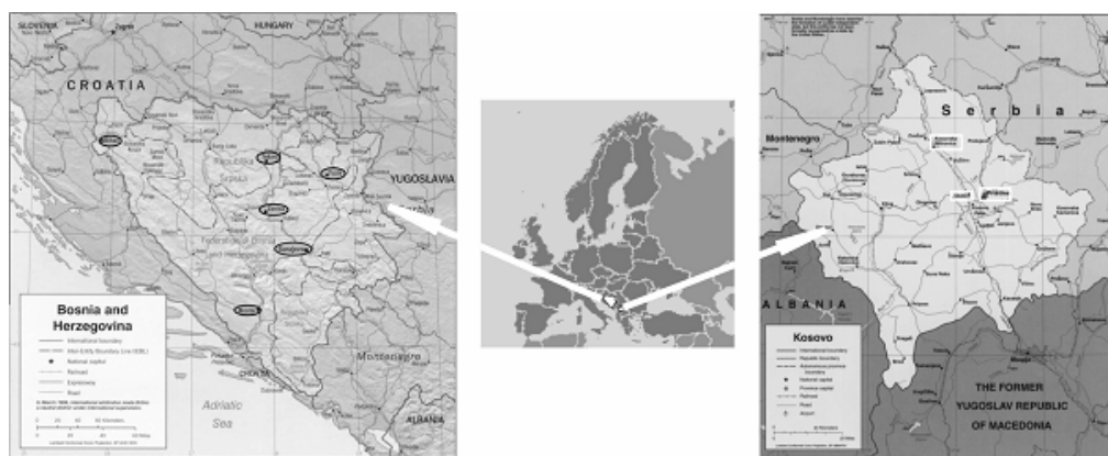
Figure 1. Maps showing sampling areas in Bosnia and Herzegovina and Kosovo

Only one small sampling campaign was performed in Kosovo during 2003. Seven sediments from rivers Sitnica and Ibar were taken for the PCB analysis and one sample of the mud from the waste water in the TEPP Kosovo B.