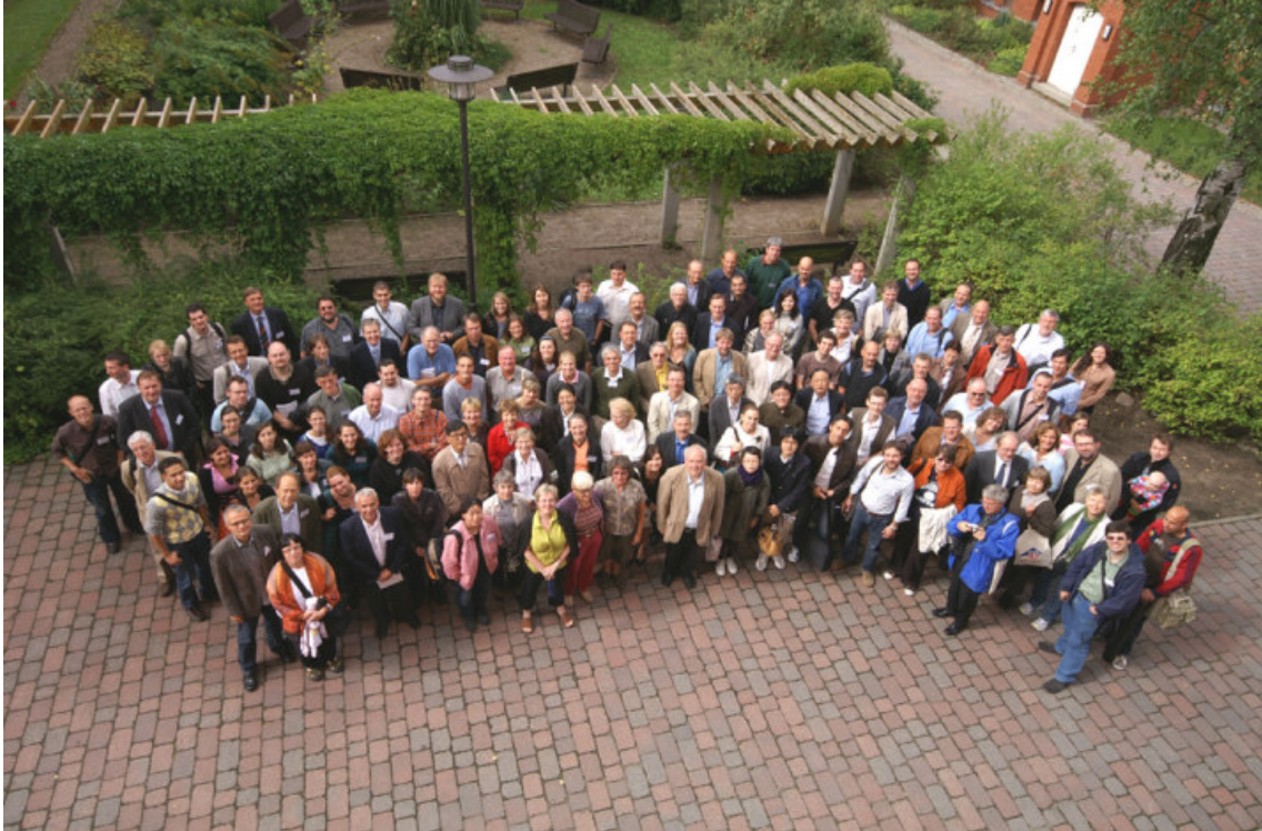
Greifswald conference photo