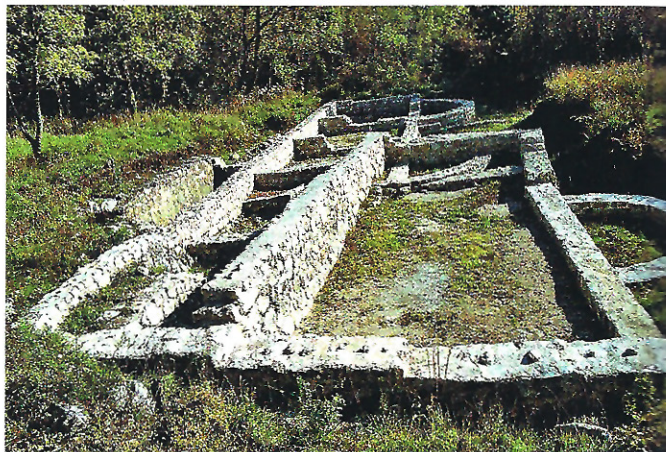
JADRANOVO, villa rustica