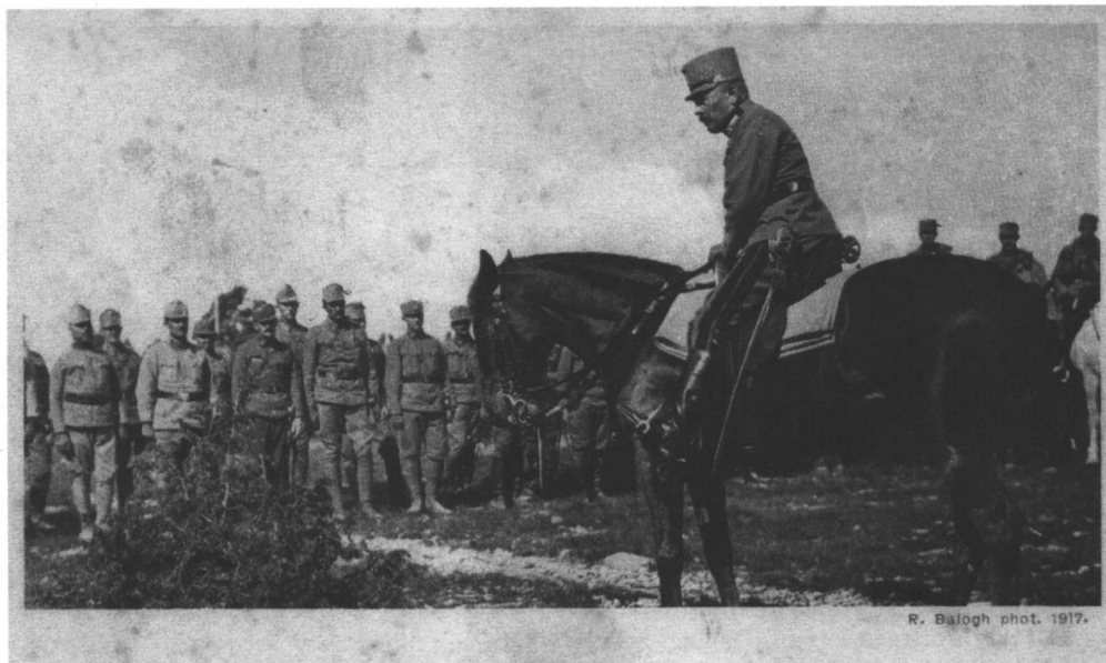
1. Borojević addressing his soldiers, c.1916, postcard, private collection, Berlin.

'So!' The Count sighed with relief. 'We have passed the most dangerous part. Hetzendorf lies on the other side.' The emperor pointed to the alley, stretching towards Laxenburg, and then, because the name of this castle reminded him of the aristocratic title of the field-marshal, asked the count what Conrad was doing at the moment.