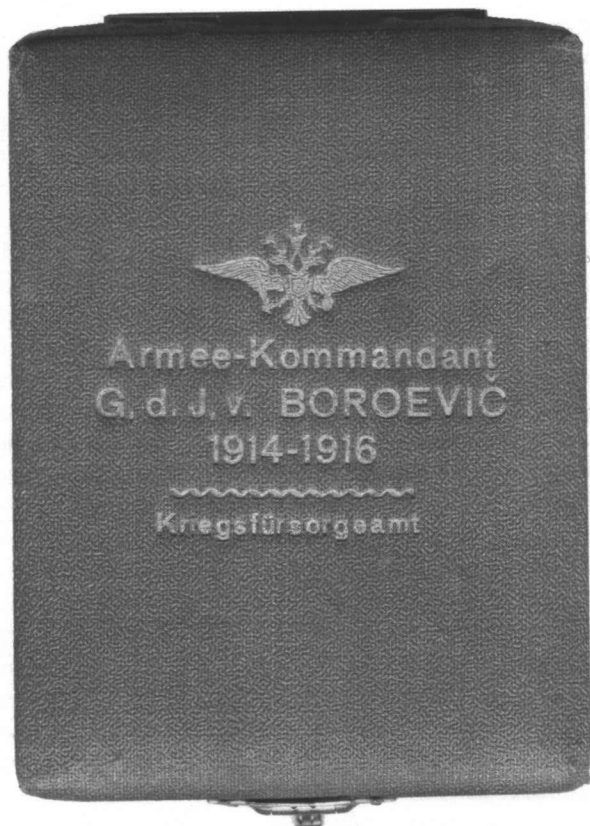
6. Box for a medal of Svetozar Borojević (fig. 4).