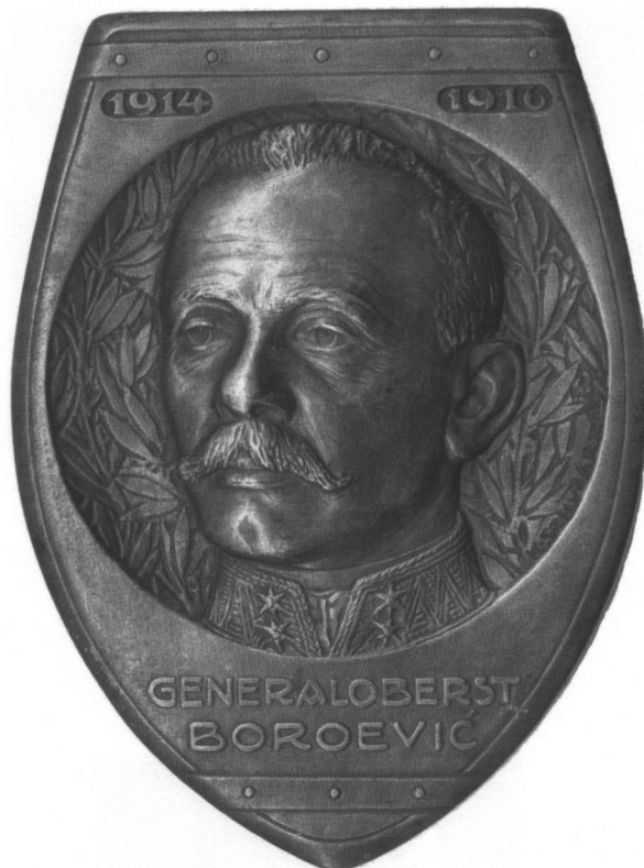
9. Schwarz: Svetozar Borojević , 1916, bronze, 138 x 97mm., private collection, Zagreb.