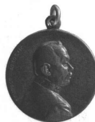
16. Unidentified artist: Svetozar Borojević, 1917, pewter, 23mm., Kunsthistorisches Museum, Vienna.

family home at Mečenčani, as the house in which he had been born was no longer standing (fig. 14). It was unveiled on 28 October 1917, but has since been removed – probably in 1918, although, according to some rumours, this happened as late as 1945. Frangeš-Mihanović also made a bronze statue of Borojević on horseback, a plaster cast of which exists in the Glyptothek of the Croatian Academy of Science and Arts. 17