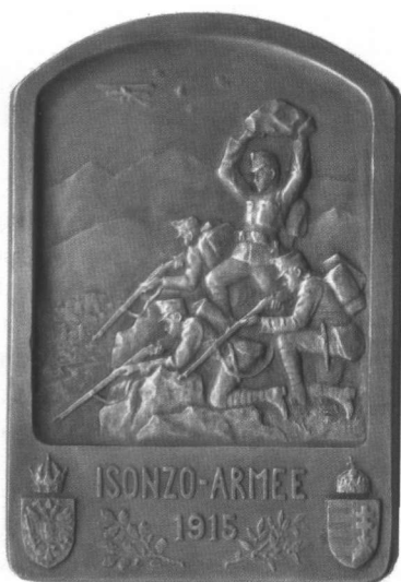
4. Hermann: Svetozar Boroević, 1915, silver, 70 x 48mm., private collection, Zagreb.