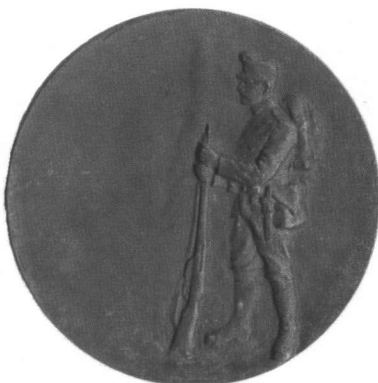
2. Bachmann: Svetozar Boroević, 1915, pewter, 51mm., Zagreb Archaeological Museum.