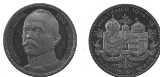
11. Unidentified artist: Svetozar Borojević, 1916, silver, 33mm., Kunsthistorisches Museum, Vienna. Struck by Mayer & Wilhelm.