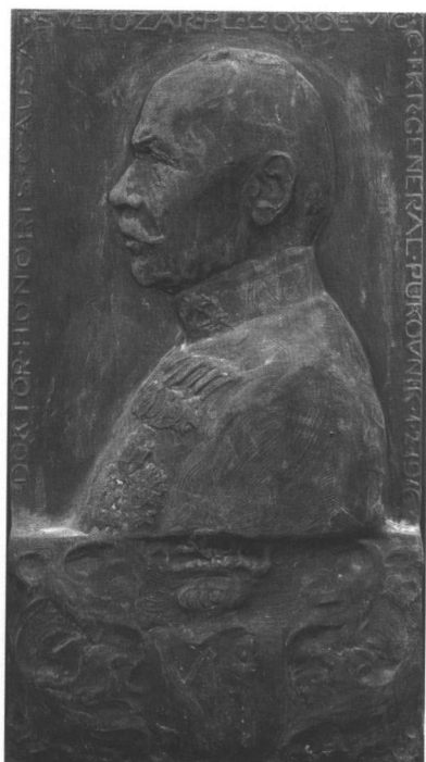
13. Frangeš-Mihanović: Svetozar Borojević, 1917, bronze, 92 x 49mm., Croatian History Museum, Zagreb.

situated in a hilly landscape, with an eagle with closed wings standing on each of its pillars and in the foreground a standing soldier barring the way with his rifle. The inscription on the front right pillar translates as 'Gorizia and Trieste', and the exergue inscription as 'Closed for Italians'. The artist's signature appears on both sides of the medal. 12