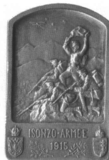
5. Hermann: Svetozar Boroević, 1915, silvered bronze, 44 x 24mm., private collection, Zagreb.