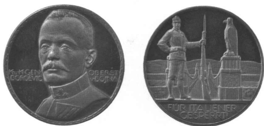
10. Hoppe: Svetozar Borojević, 1916, silver, 33mm., Kunsthistorisches Museum, Vienna. Struck by Lauer.