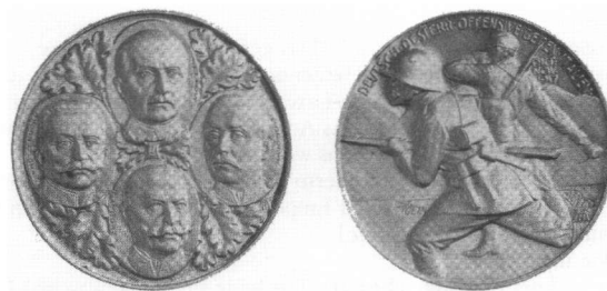
15. Hummel: The Austro-German offensive on the Isonzo, 1917, silver, 33mm., private collection, Germany.