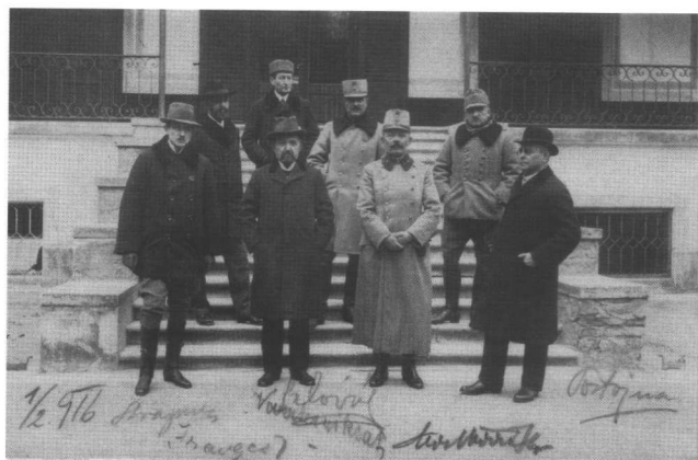
12. Svetozar Borojević surrounded by members of the Zagreb university senate, Postojna, 1 February 1916, photograph, Diocese of Syrmia-Bosnia, Dakovo, archives.