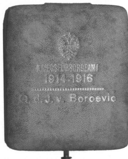
7. Box for a medal of Svetozar Borojević (fig. 5).