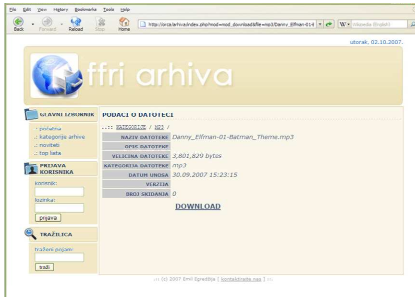
Fig. 3. Content information and download of file

technologies used for GUI are standards for web application interface design: HTML, CSS, Javascript. All the components are glued together using design templates so newly created design can be easily imported in the system. Web application homepage is shown in Figure 2, and content information and download link are presented in Figure 3.