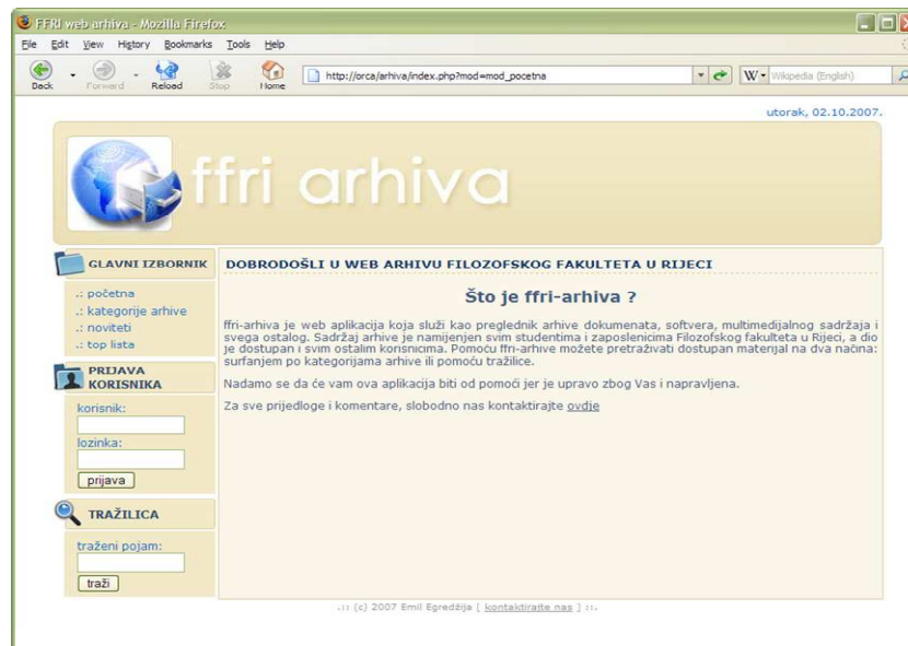
Fig. 2. Web application homepage