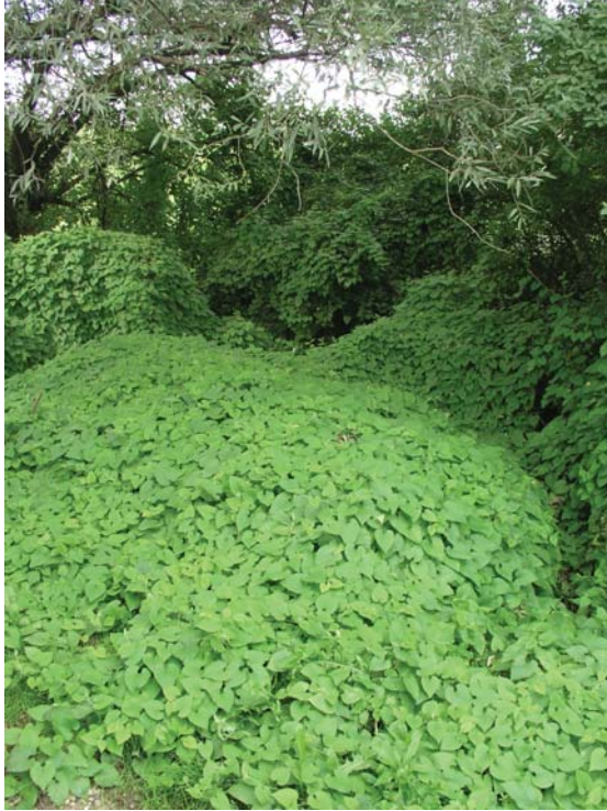
Fig. 1. Stand of Thladiantha dubia in the remnants of floodplain forests of willows and poplars ( Salicion albae ) at Savica.