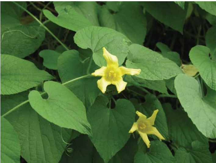
Fig. 2. Female flowers of Thladiantha dubia .