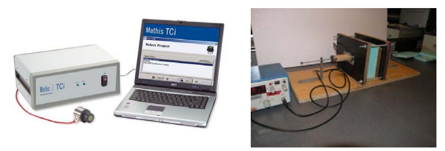
Figure 1. Mathis TCi Thermal Property Analyzer

Beside the thermal properties measurements hydration process was monitored using ultrasonic pulse velocity (UPV) test. An experimental setup was made so that changes of the ultrasonic pulse velocity through cement paste sample can be continuously measured during the first few days of hydration. Measuring system (Figure 1)consists of a pulse generator which has a pulse repetition frequency of 1 pulse every 4 seconds. The pulse is converted to an ultrasonic wave through 54 kHz piezoelectric sensor. The wave is then transmitted through the material and picked up by a receiver, which is also 54 kHz piezoelectric sensor. Pulse generator is connected to a PC so that information about the speed of the ultrasonic wave is recorded. Sample of cement paste is placed in the mould after mixing and measurement is started. Results of time of flight are recorded to the computer every one minute and UPV is then calculated.