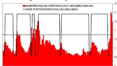
Graph 1 Economic cycles in the U.S.

Note : The graph shows data from 1970: Q1 to 2008: Q4. Right scale: An indicator of the perception of systemic risk – spread between corporate bond issuer credit rating of AAA and BAA; Left scale: Phases of the economic cycle in the U.S.