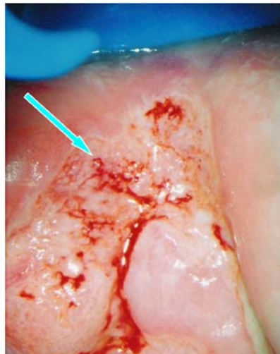
Figure 5. Speculoscopy demonstrates vulnerable and bloody surface confined on the uterine cervix, no larger than 2 cm in diameter, histopathology revealed carcinoma planocellulare invasivum cervicis uteri, FIGO stage: IB1 cervical cancer (arrow).

probability of stromal invasion increases with the level of lesion spread on the surface. If the microinvasive cancer is entirely within the endocervical canal, the ectocervix can seem alright during colposcopy. Signs of microcancers of the ectocervix are atypical blood vessels, prone to bleeding.