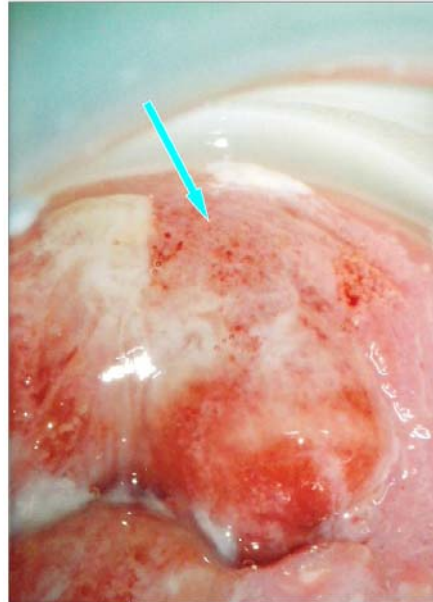
Figure 4. Anterior lip of the uterine cervix demonstrating coarse punctation as a sign of serious underlying lesion (microinvasive adenocarcinoma on punch biopsy, arrow).