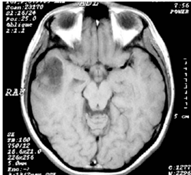
Figure 1. T1-weighted imaging with gadolinium enhancement MRI slice showing low-grade glioma which is partially hypo and partially isointense, occupying right temporal lobe with cortical presentation.

the upper part of the cerebellar-pontine angle and the right portion of the clivus starting from the brainstem in a 39 year-old man [9]. Their patient remains in a good neurological condition after ten months in spite of the fact that only subtotal excision of the tumour was accomplished and adjuvant chemotherapy and radiation therapy were not administered. Immunohistochemistry for GFAP and S-100 proteins proved the glial nature of lipid-laden cells. Ki-67/Mib-1 labelling index was low (2%).