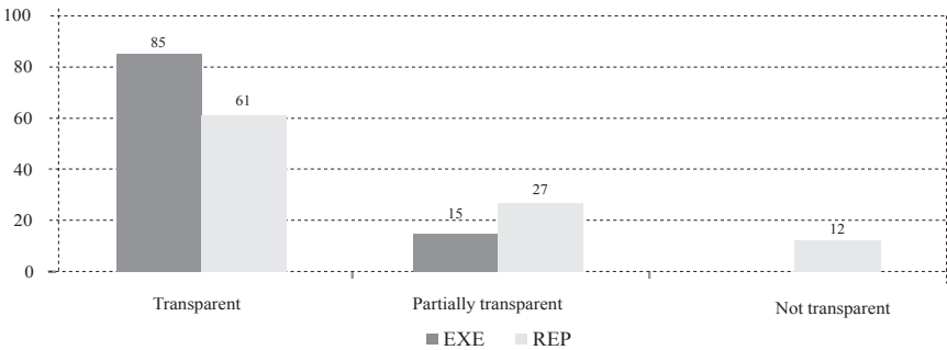
FIGURE 2 Transparency of the process of exchange of budget documents between city executive and representative bodies (%)