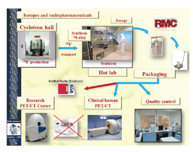
Figure 1. The existing facility and planned extension of RBI PET Center

main tasks is not only technical development; we have to devote a significant part of our time to teaching our colleagues and spreading knowledge about PET methods. Up to now we have developed notable interest of our colleagues in research on diabetes, research on tumour diseases and oxidative stress. We have also attracted the attention of our colleagues from the Croatian Institute for Brain Research (CIBR) and the University of Zagreb School of Medicine (SM). With CIBR we have started research on FDG distribution of ischemic brain insult in mice, and with SM we have initiated the study of FGD distribution of ischemic heart insult in rats.