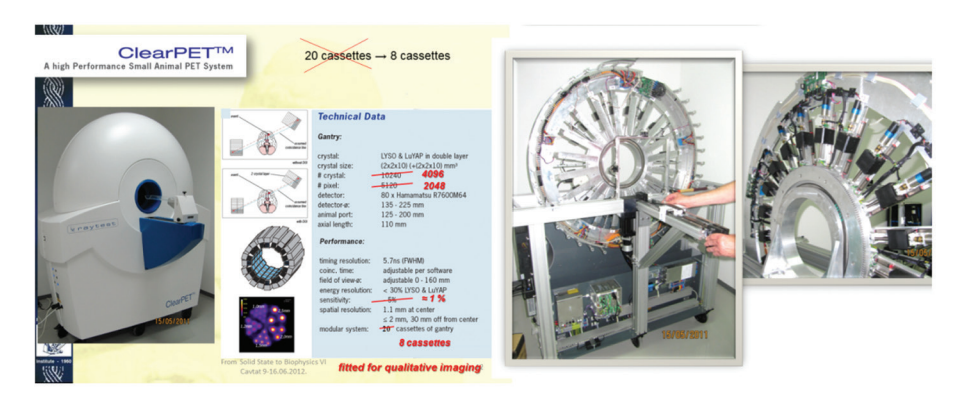
Figure 3. The minimal PET system purchased