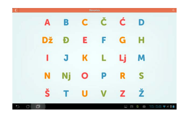
Figure 2. The second version of application Slovarica