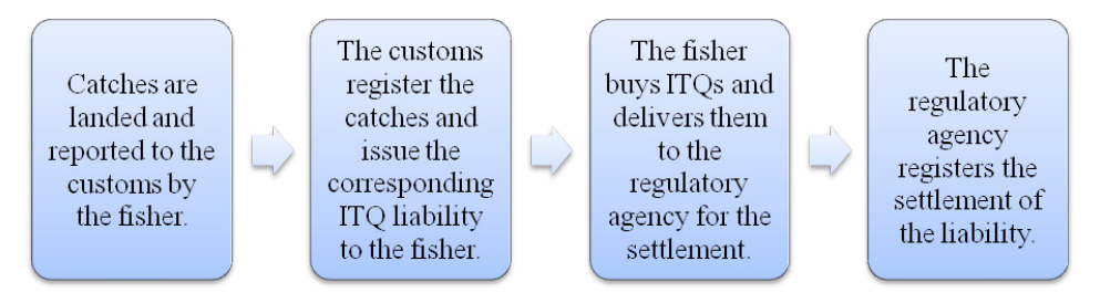
Figure 1 Individual transferable quotas within the system of transferable fishing concessions

amend all major directives and decisions concerning the CFP and combining it with the Common Maritime Policy (CMP) consisting of the so called "Blue Growth" (maritime and coastal tourism, ocean renewable energy, marine mineral resources, aquaculture, and blue biotechnology), maritime transport, and shipbuilding, into an Integrated Maritime Policy (IMP) [3][4]. EU proposes the use of market allocation mechanisms to conserve fish stocks within sustainable levels. In a system of Transferable Fishing Concessions (TFCs) the fisher has an obligation to hand out the amount of Individual Transferable Quotas (ITQs)