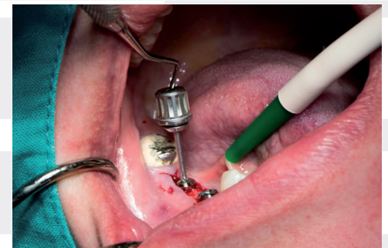
Fig. 5: Fixation of the cover screw after application of GapSeal®.