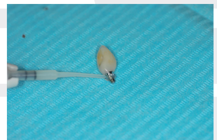
Fig. 6: Application of the material for the prosthetic suprastructure.