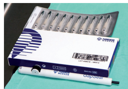
Fig. 1: GapSeal® (Hager & Werken, Duisburg, Germany) disposable sterile tips with applicator.