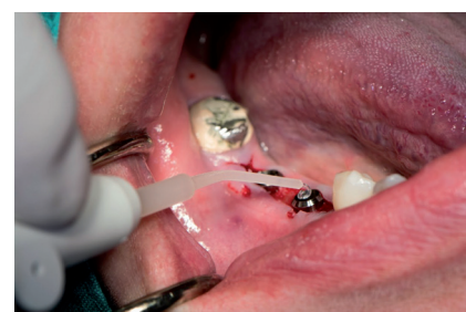
Fig. 3: Application of the material into the osseointegrated dental implant.