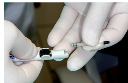
Fig. 2: Simple insertion of carpule into the applicator.