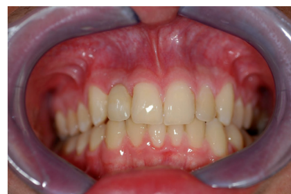
Fig. 8: Final clinical aspect after fixation of the prosthetic suprastructure.