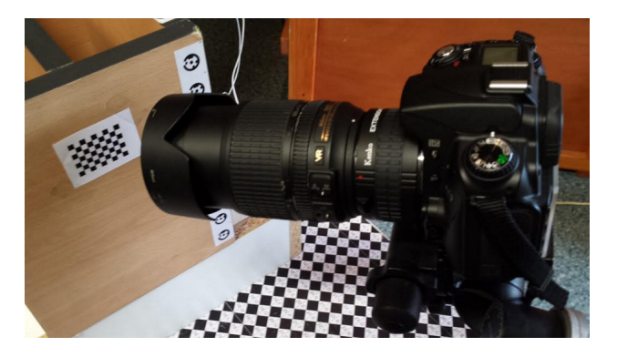
Figure 1. Camera with extension tube at the calibration field

According to the extents of the object, the calibration plate was designed.