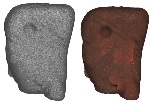
Figure 5. Ancient amber figurine. a) TIN-model; b) photorealistic textured model

camera's image sensor (about 5 \mu m). However, the reconstructed positions of control points in reference coordinate system are acceptable. The biggest total displacement error is 0.063mm at control point nr.11; what for intended application seems acceptable (Table 4). After phototriangulation, the dense point cloud was reconstructed (54398 vertices), followed by interpolation of the model surface by applying the Triangular Irregular Network procedure, resulting in 107546 faces (Figure 5.a). Finally, the photorealistic textured model was generated. The pixel size at the model's surface is 11x11 \mu m. (Figure 5b)