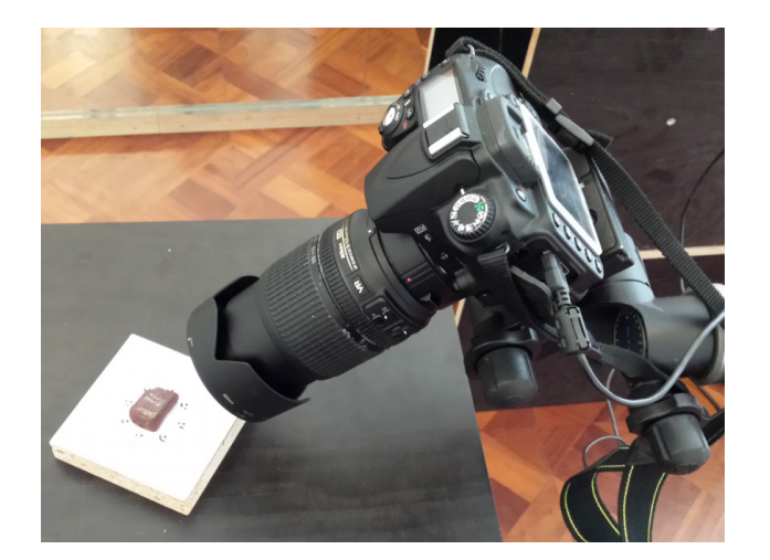
Figure 2. Photographing of the ancient amber figurine.

The calibration plate has eight binary coded photogrammetric signals. During the reconstruction of 3D-model the software recognises the binary-coded signals, measures them and records the image coordinates of them at every image where they are visible. The 3D-reconstruction was done by dividing images into two groups, one per each side. On that way, we could use the control points at each side.