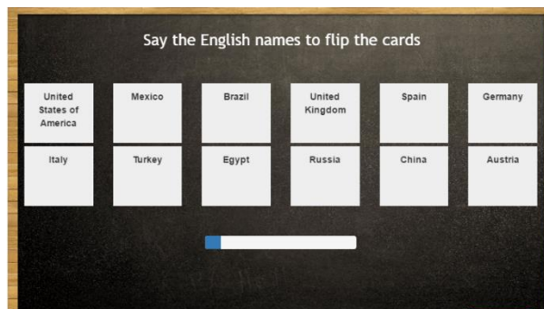
Figure 2. Teaching countries

The design and the structure of the tasks also followed the principle of multiple skills engagement. For example, when teaching countries the tool for voice recognition was used. Look at the Figure 2.