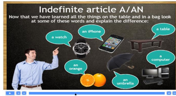
Figure 1. The indefinite article rule introduction

The visuals were used to demonstrate the rule of indefinite article a and an . The students were asked to try to see the difference between the usage of indefinite article a and an before they are given explanation on the next slide.