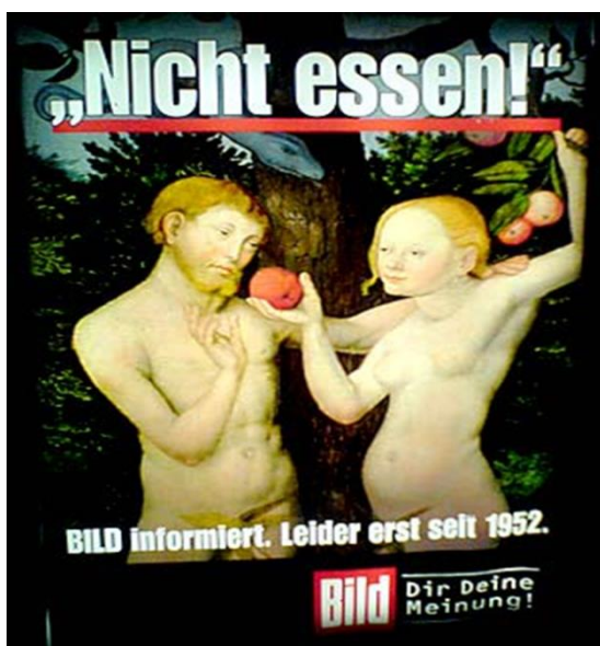
Figure No. 3 – “Nicht essen!”

Thereafter the pupils are shown a print ad of the German popular newspaper Bild, whose name itself leads to several linguistic puns and allows the use of interesting figures of speech (Fig. No. 3).