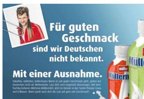
Figure 4 – Für guten Geschmack sind wir Deutschen nicht bekannt

For the third phase of our unit of work, we chose the Müllermilch recently developed advertising campaign for the German speaking area of Switzerland (Tessin). The German multinational producer advertising strategies are usually provocative, such as in the following print ads and posters; actually, Müller uses deliberately those clichés about German prevailing in Switzerland. In figure No. 4 the picture of the German testimonial (and his sandals in figure No. 5) should self ironically prove the bad taste of the Germans and advertise simultaneously for Müllermilch good taste.