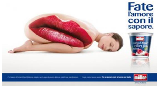
Figure 6- Fate l'amore con il sapore

Finally, it could be asked to the students to think about possible translation into Italian of the above mentioned, considering that the whole visual presentation has to be translated to adapt to the target culture addressed. The plurality of the advertising codes allows the teacher to carry out educational activities both on the relationship between verbal and non-verbal languages, and on the analysis of sociocultural and intercultural aspects that ads and commercials show up in their timeliness and complexity.