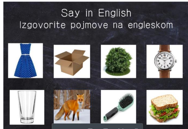
Figure 5. Noun plural section

of the online course. The new vocabulary is initially introduced through meaningful phrases, as it was stated earlier. If it is not mentioned in the phrases it is mostly introduced with the usage of visuals (see Figure 5).