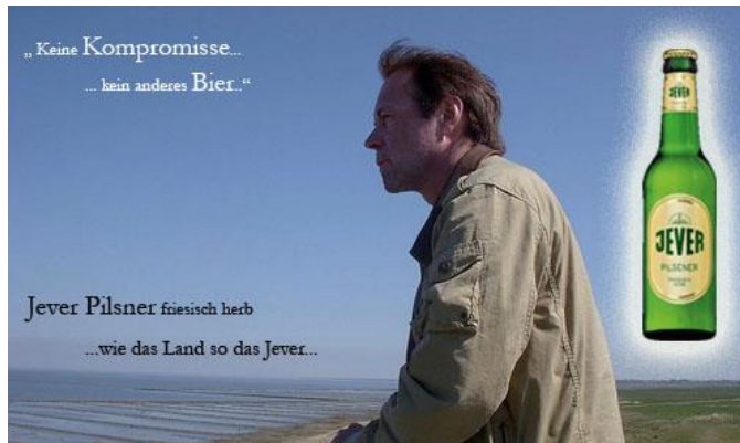
Figure 2 – Kein anderes Bier

In the Slogan.de database we also retrieved another popular headline used both for print advertising campaign (Fig. No. 2) and for a TV commercial of the Jever beer: Keine Staus. Keine Hektik. Keine cocktail parties. Keine Handies. Keine meetings. Keine Kompromisse. Kein anderes Bier. (English translation: No tail. No hustle. No cocktail party. No cell phones. No meetings. No compromises. No other beer).