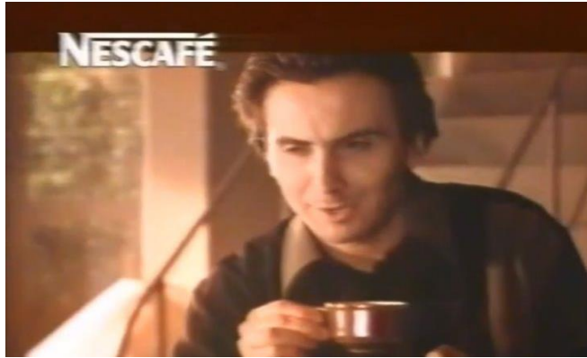
Figure 1 – "Isch abe gar keine Auto, Signorina!"