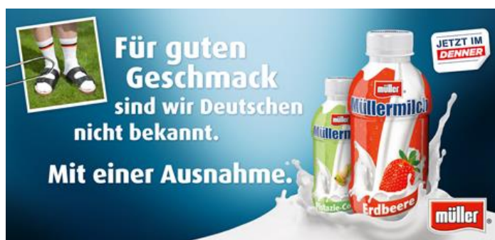
Figure 5 – Für guten Geschmack sind wir Deutschen nicht bekannt

The class will first translate in plenum the headline, Für guten Geschmack sind wir Deutschen nicht bekannt. Mit einer Ausnahme. (Engl.: For having good taste we Germans are not famous. With an exception), into Italian. After that, the teacher can introduce the Schumann's concept of „national Images“ (Schumann, 2008), namely uncritical and stereotypical images which refer to foreign populations, only represented by some features, easily recognizable. National images are very frequently used by copywriters because of their emotional charge that can capture the attention of consumers and establish an interpretative cooperation with them.