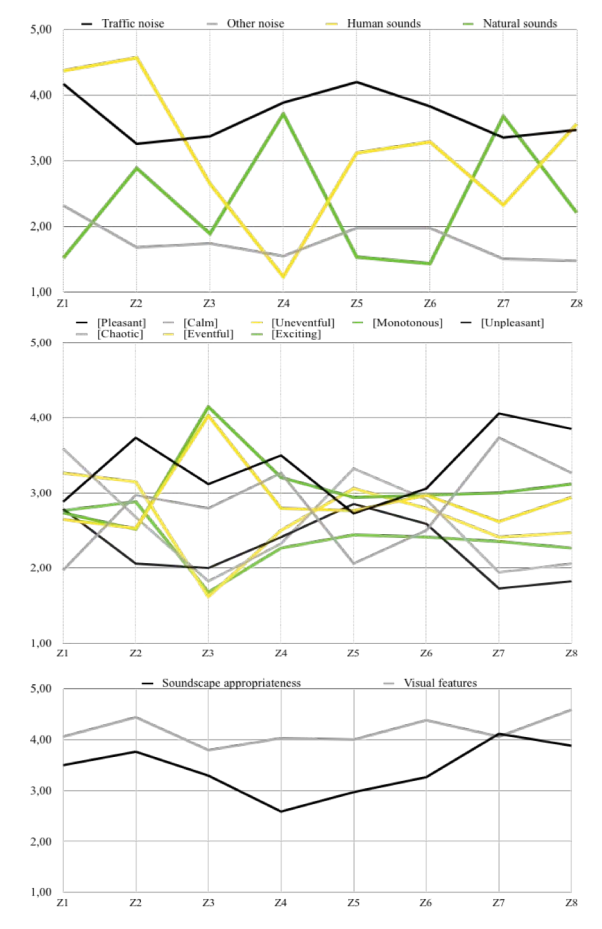
Figure 3. From top to bottom: dominance of sound source types, soundscape perception descriptors and soundscape appropriateness for the Zagreb case.

The analysis of soundscape perception descriptors showed that the initial idea is not perceptible or that it does not significantly contribute to the overall soundscape quality. Figure 3 shows the soundscape perception values for the sequence in Zagreb, featured in a previous study [8]. The listening experiment proved the perceived dominance of the traffic noise which contributed to ambiguous values of the soundscape perception descriptors.