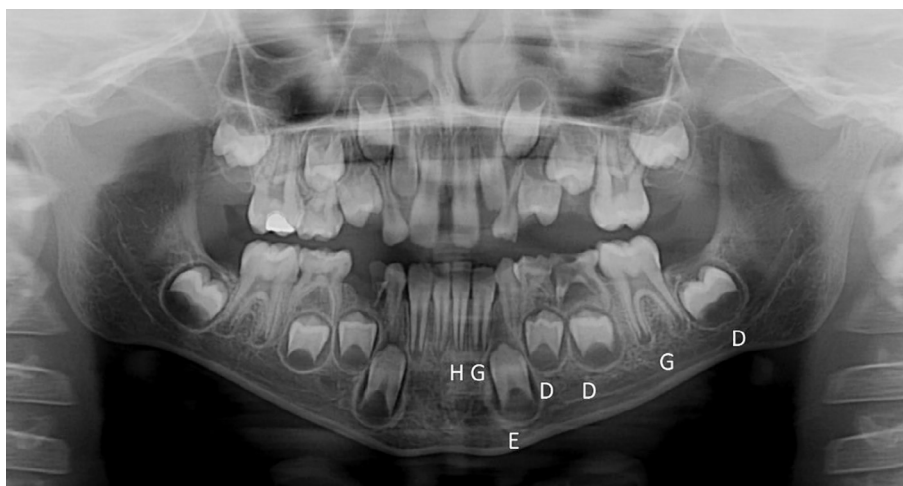
Fig. 1. A sample of Demirjian's developmental stages on the first seven left mandibular teeth.