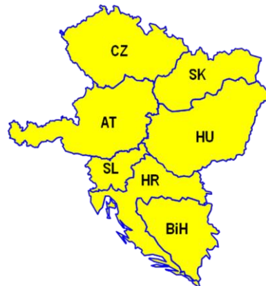
Figure 3: FAB CE

Due to a wide range of approaches and quality in cost-benefit Analyses, it is not easy to assess and compare the magnitude, timing and robustness of expected improvements from FAB initiatives. In FABs - FAB EC, FAB CE and Blue Med are currently visible significant differences between operational concepts which is a potential cause of delay in effective